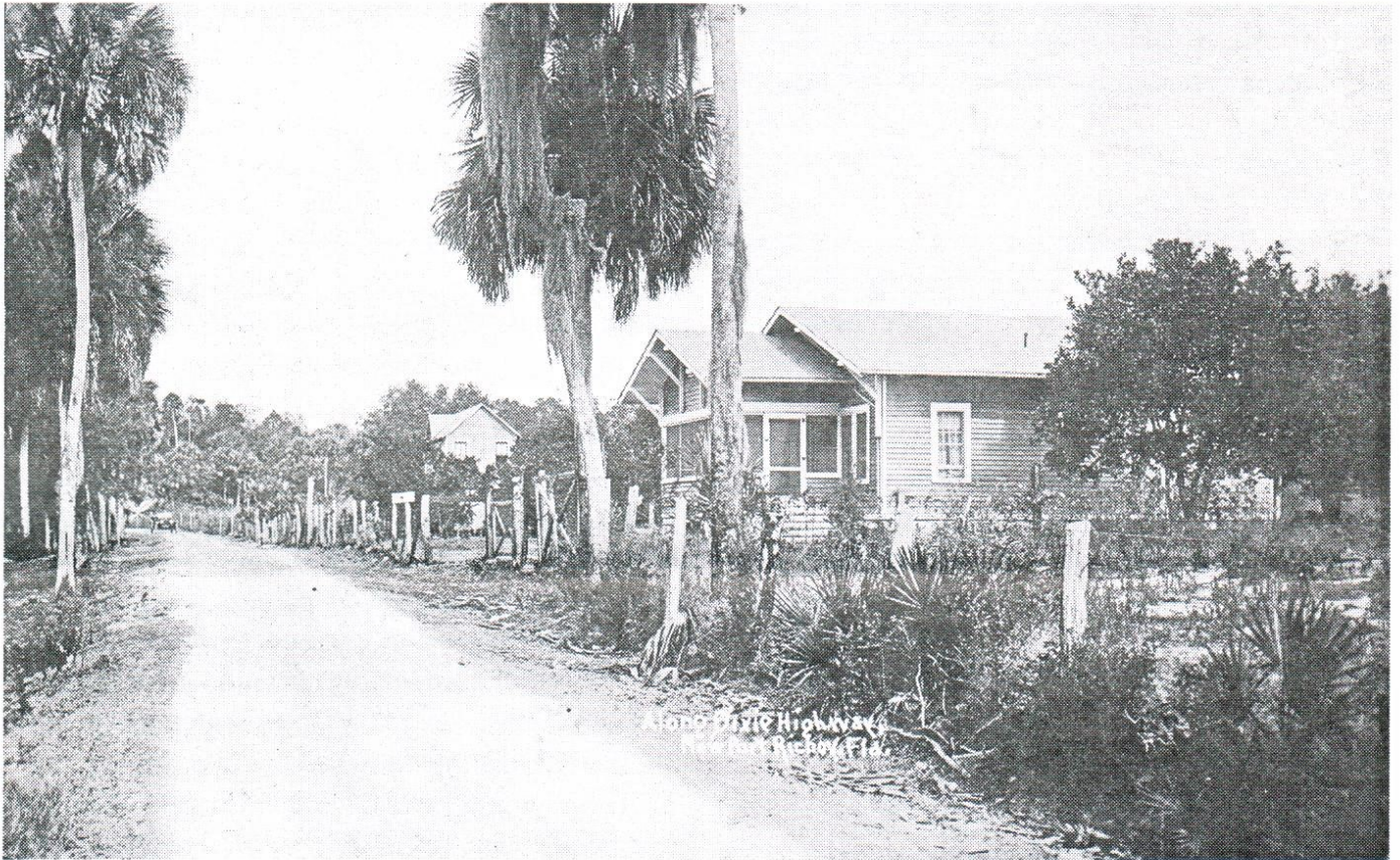
Homes along Dixie Highway, now Grand Boulevard.