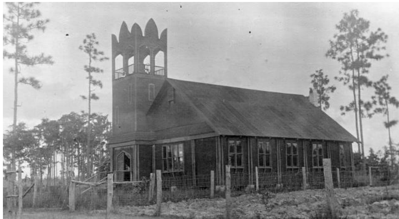
Union Congregational Church, built in 1914

"There's a church in the valley by the wildwood, no lovelier spot in the dale; no place is so dear to my childhood as the little brown church in the vale."