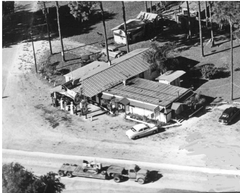
Bowman's Trilacoochee Restaurant