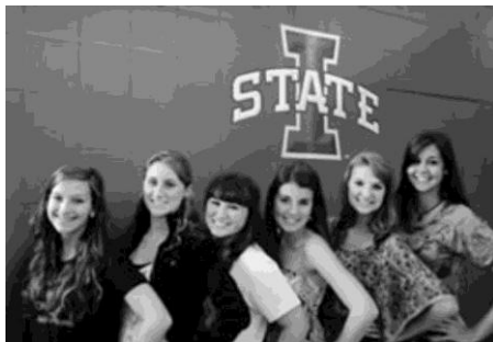
Odyssey of the Mind Team