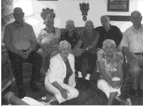
Class of 1952