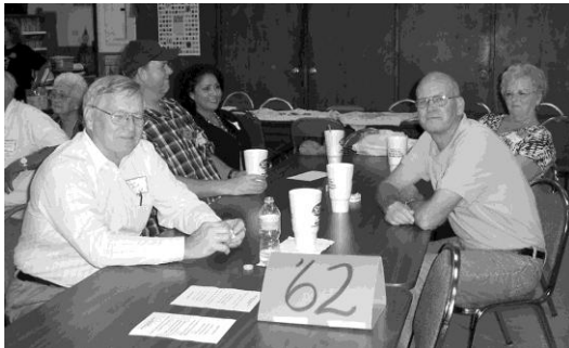
Class of 1962