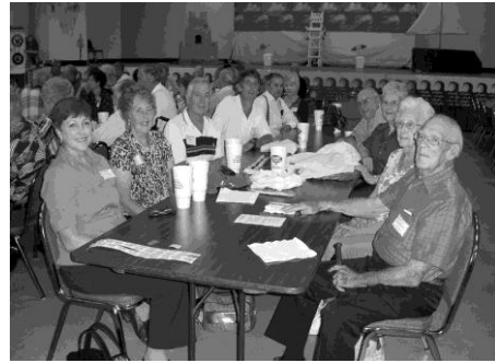
The Forbes Family