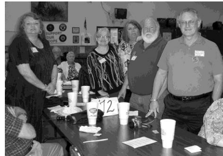
Class of 1972