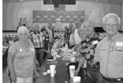
Class of 1957