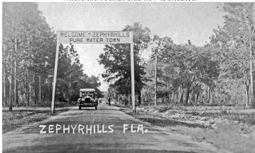
Probably taken in the early twenties.