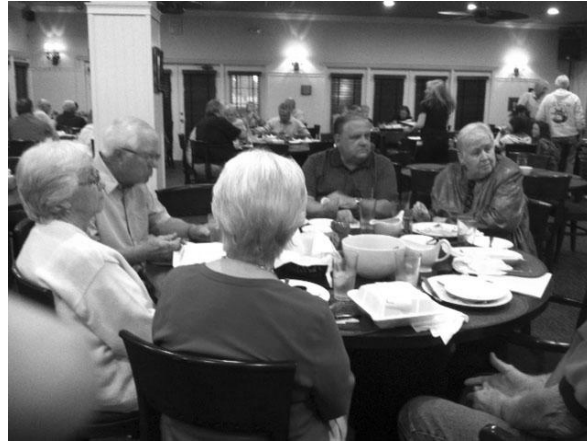
Dinner – Scotland Yard – February 17, 2012

----- Cut along line and return with payment