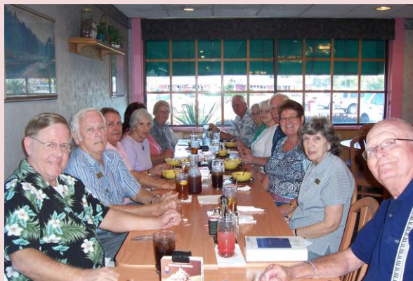
ZHA Dinner Out — Village Inn — October 12, 2012