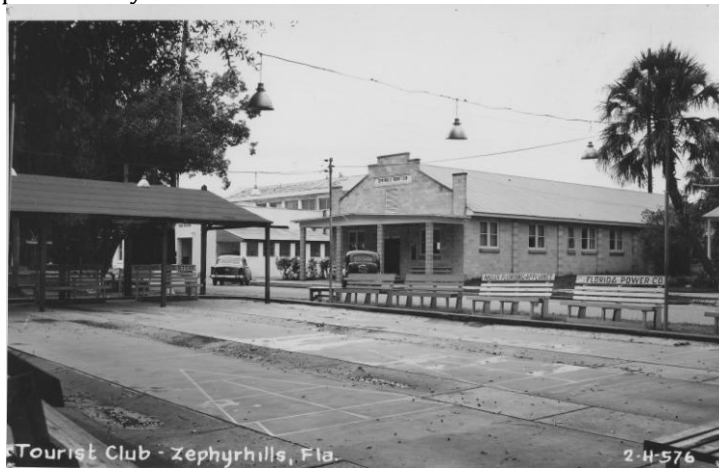
Tourist Club – 1946

The Zephyrhills Tourist Club has long been a venue for couples to go dancing, play cards, socialize and enjoy many activities with live entertainment. Shuffleboard tournaments are also another form of entertainment sponsored by the Tourist Club.